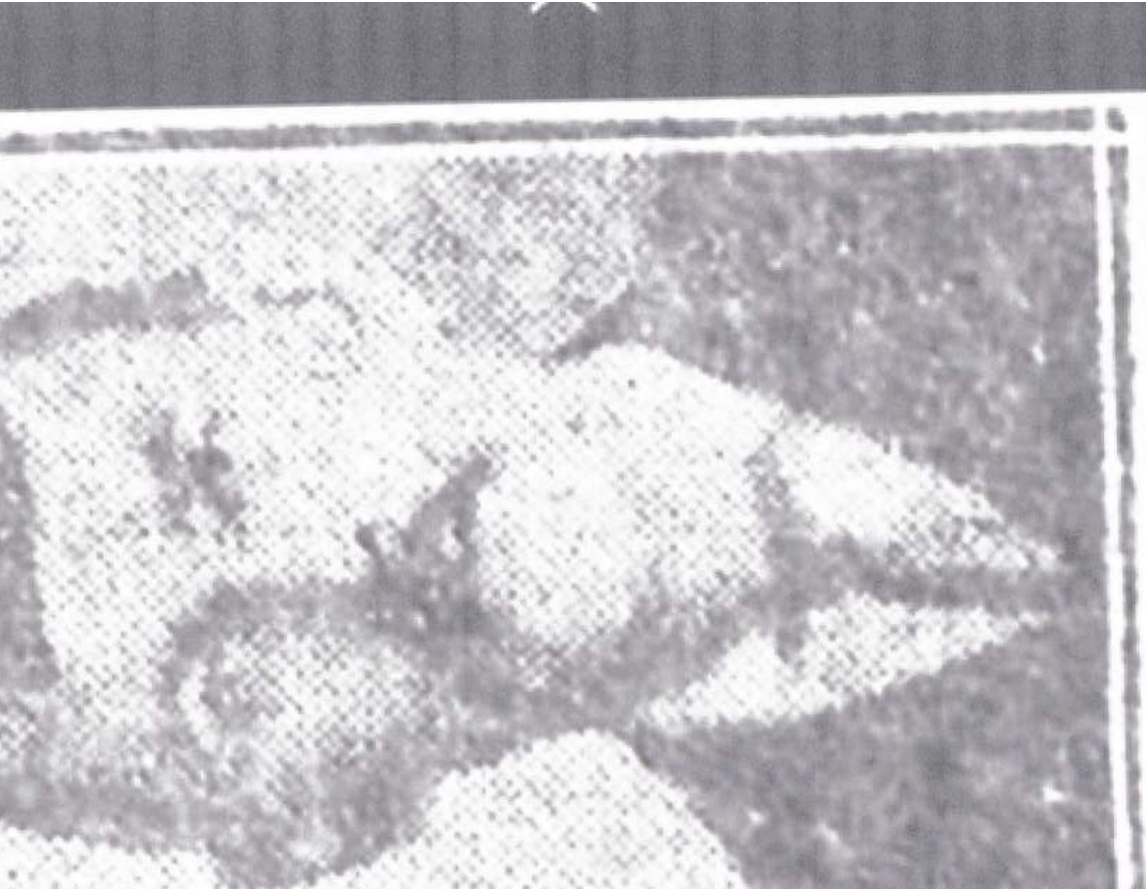
FIG. M. GALLAGHER.